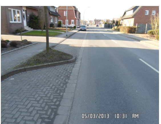
Figure 5. Condition in March 2013