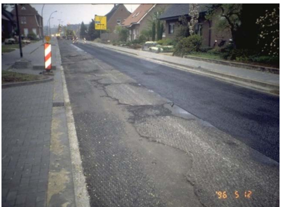
Figure 4. Condition after milling in May 1996

To further investigate the condition, two drill cores have been taken. At one core, the interlayer bond according to Leutner had been checked. Between the asphalt bearing course - Polyester reinforcement - and upper asphalt layer a maximum shear force of 24 kN was measured. The German guideline for asphalt works – ZTV Asphalt-StB 07 – demands a minimum value of 12 kN, so this demand had been fulfilled. After evaluating the whole data record of the Rosenstrasse it was found, that the condition, after a lifetime of 17 years, was still very good (Figure 5).