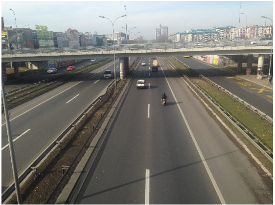
Figure 10. E75 pavement condition in 2016

Almost six years after the rehabilitation, the reinforced area in the highway E75 still does not show any indication of cracking (Figure 10). The use of a polyester grid prevented the propagation of reflective cracks developing from the cement stabilized base, proving to be an effective solution. The technique of introcucing a polymeric reinforcement into bituminous pavements has been demonstrated to extend the working life of asphaltic pavements by up to three times. It is therefore anticipated that a similar benefit is expected to be achieved on this project. This will help to minimise any traffic diversions and disruption caused by this type of remedial work, as well as reducing future maintenance costs.