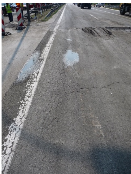
Figure 8. Reflective cracking from cement stabilized base

For this reason, the rehabilitation works designer specified an asphalt reinforcement grid to be incorporated into the new bituminous layers to mitigate any future propagation of reflective cracks through the new asphalt layers. The chosen reinforcement material was a polyester grid.