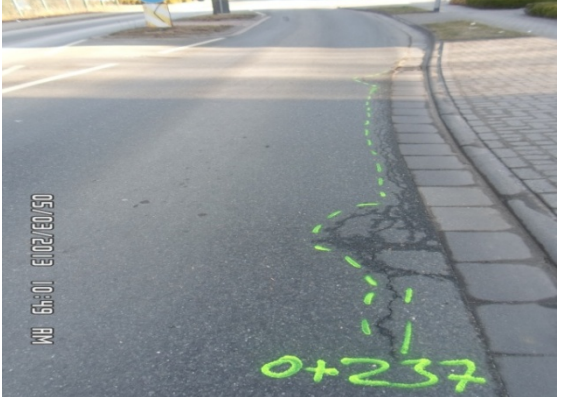
Figure 6. Cracking resulting from road works