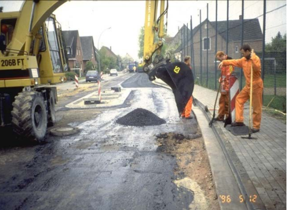
Figure 7. Repair works at the road edge in 1996

The dual carriageway E75 is one of the most important highways of Serbian road infrastructure. In 2010, the asphalt overlay of a section in Belgrade had become damaged by reflective cracking, likely caused by the cracking of the cement stabilized base (Figure 8). Cement stabilized layers provide excellent support for asphalt surfaces, however, it can lead to shrinkage cracks, which reflect through the asphalt surface.