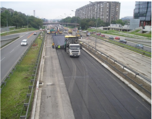
Figure 9. Asphalt placement on HaTelit

The exisiting pavement comprised of base, binder and wearing courses. The top two layers were removed to a depth of approximately 150 mm by milling. The milled surface was then brushed clean and a polymer modified emulsion was evenly sprayed onto the milled surface (in accordance with the manufacturer's installation guidelines). After the emulsion had been left to 'break' the installation of the polyester grid was carried out by unrolling the material over the emulsion and then rolling with a light tandem roller. After this the new asphalt layer could be placed directly onto the asphalt reinforcement grid (Figure 9). The road rehabilitation was carried out in July 2010.