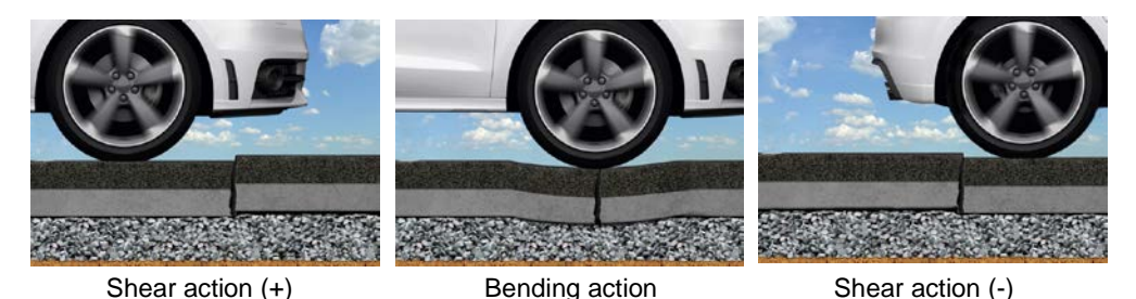
Figure 1. Critical loading cases in a pavement crack

A conventional rehabilitation of a cracked flexible pavement involves milling off the existing top layer and installing a new asphalt course, but cracks are still present in the existing (old) asphalt layers. As a result of the horizontal and vertical movements at the crack tip, the cracks will propagate rapidly to the top of the rehabilitated pavement.