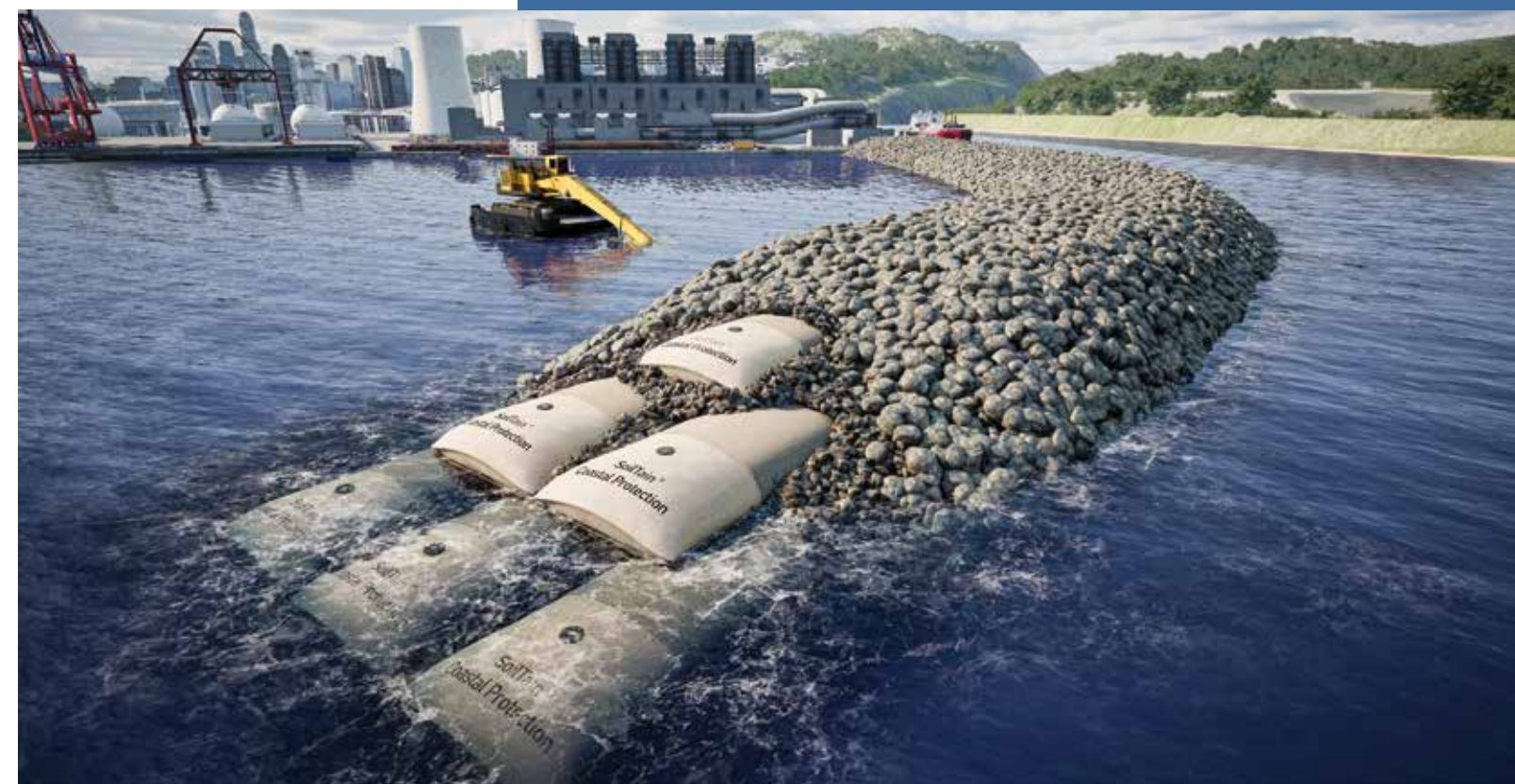
Products: SoilTain® CP Tubes