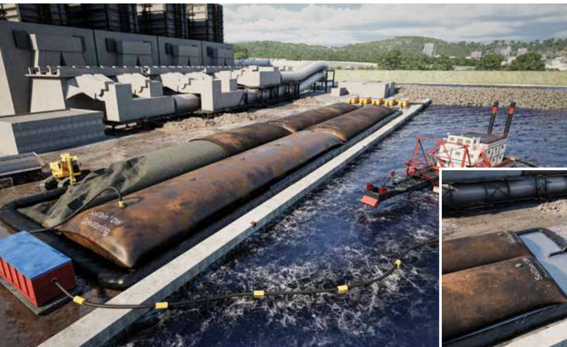
Products: SoilTain® DW, SoilTain® Bags as pollutant filters