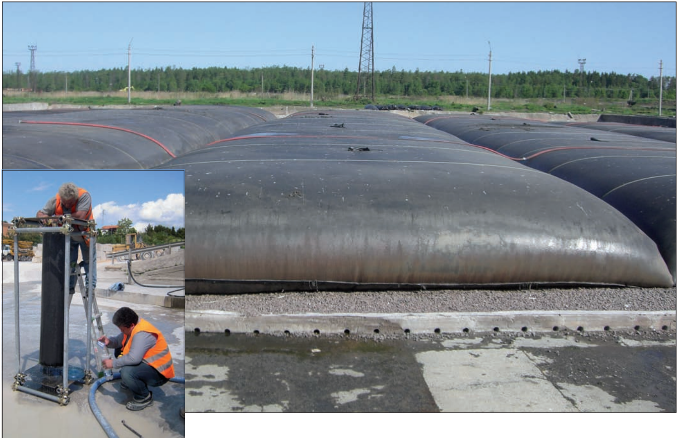
Hanging Bag Filtration Test

The SoilTain® Dewatering Tube is a containment system designed for dewatering a wide variety of sludge types. Gravimetric drainage of the sludge is accompanied by a volume reduction.