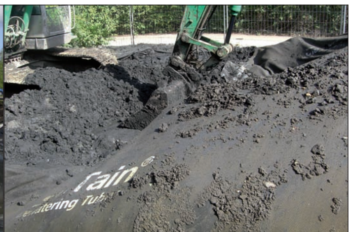
Disposal of the dewatered material