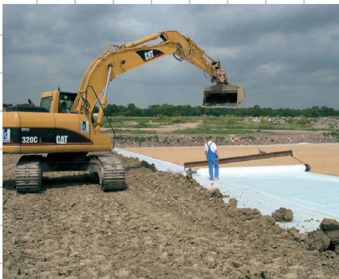
Capping a sludge lagoon